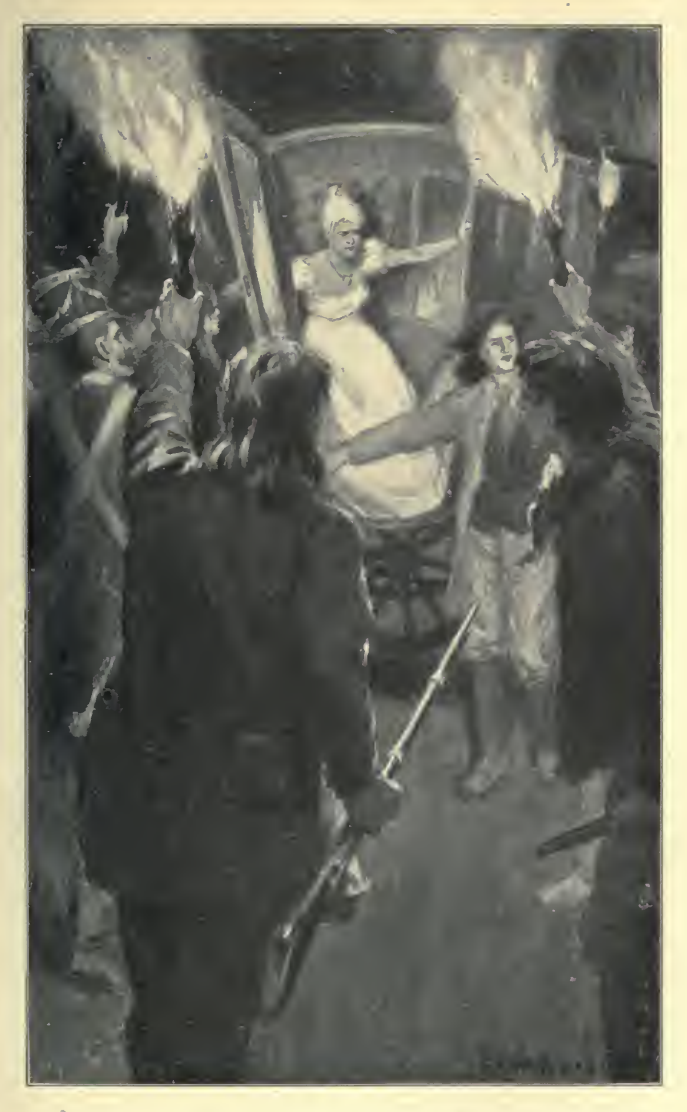
"Let Mademoiselle de Courtornieu pass without hinderance."